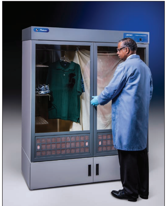
Shown above: 5' Protector Evidence Drying Cabinet 3405010

Note: See reverse side for ordering information on accessories including paper liners and cleaners.