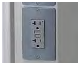
9851500 Duplex Electrical Receptacle Kit, 115 volts, 20 amps AC, GFCI, 60 Hz