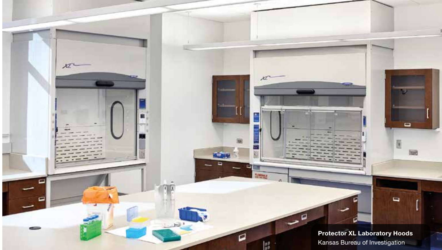
Protector XL Laboratory Hoods Kansas Bureau of Investigation