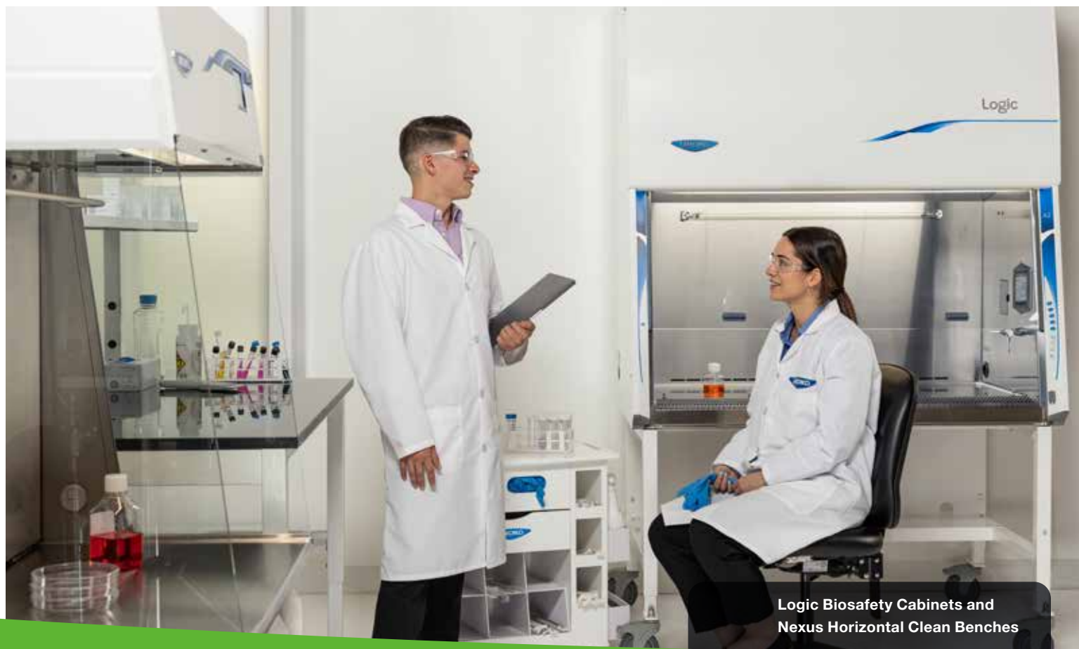
Logic Biosafety Cabinets and Nexus Horizontal Clean Benches