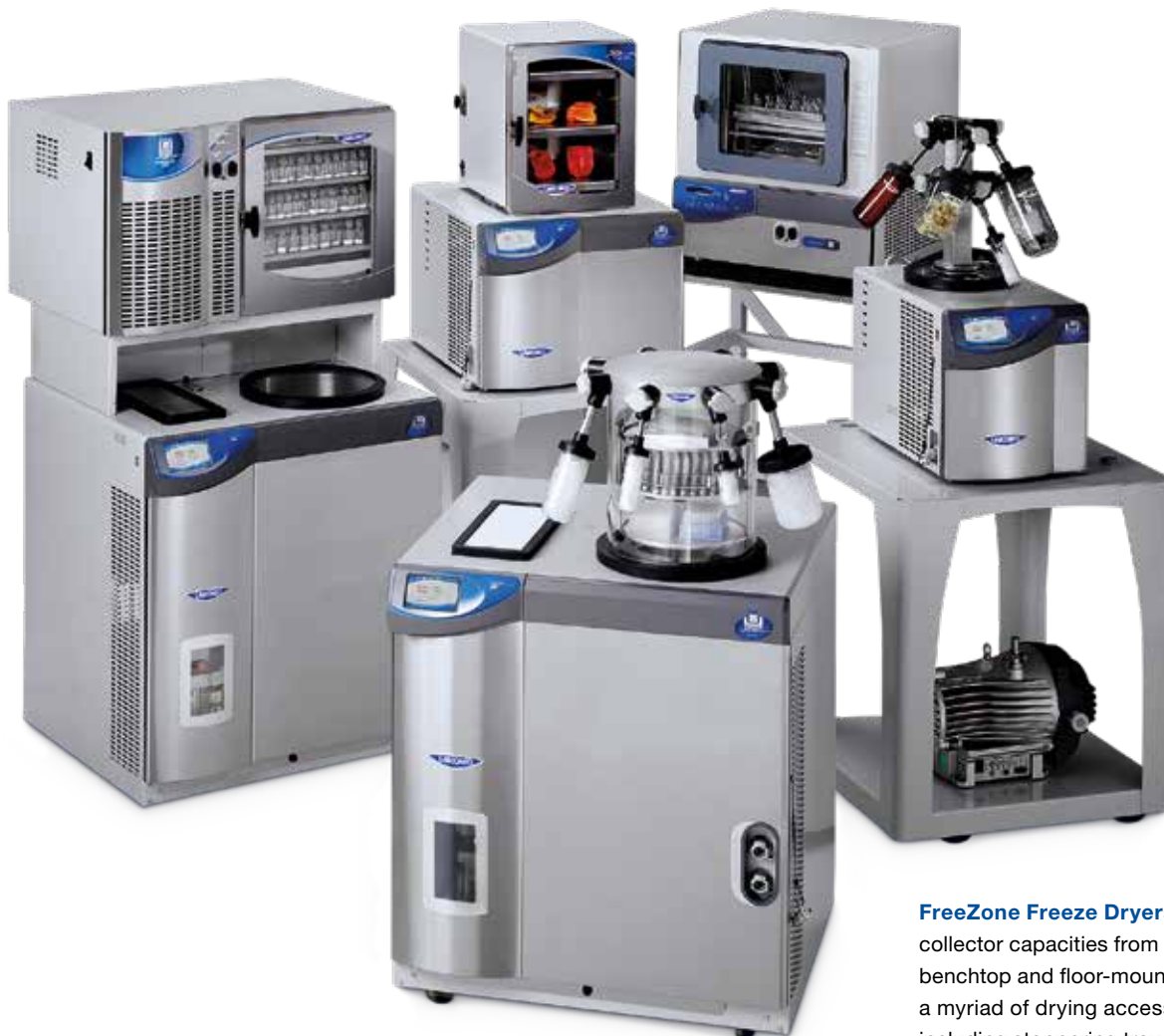
FreeZone Freeze Dryers come in collector capacities from 2.5 to 18 liters, benchtop and floor-mounted styles and a myriad of drying accessory options including stoppering tray dryers.