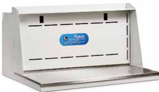
Protector Downdraft Powder Stations may be placed side-by-side to achieve an unlimited number of width combinations.