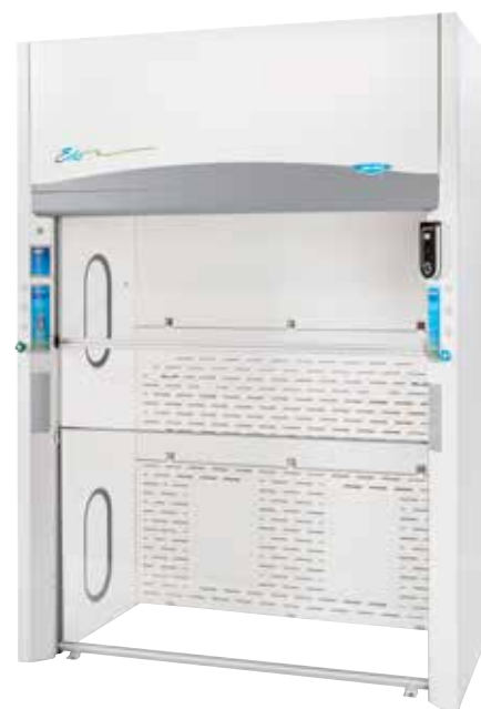
Protector Echo Floor-Mounted Filtered Fume Hoods feature Neutrodine® Unisorb filters by Erlab, the most comprehensive carbon filter available.

Labconco also has extensive capabilities in ductless fume hoods, portable fume adsorbers and exhausters, ventilation stations and work stations. We can configure with carbon filters, HEPA filters, a combination of both, or duct to the outside. Not sure what you need? Labconco's Ventilation Specialists will analyze your application and recommend the right enclosure for you.