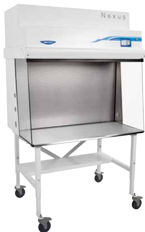
Nexus Horizontal Clean Bench models are offered in 3', 4', 5', 6' and 8' widths, generate ISO Class 4 clean air.