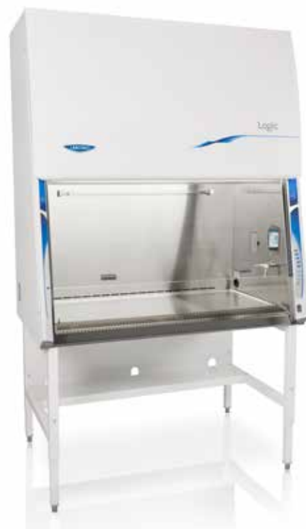
Logic Biosafety Cabinets provide safety, performance and dependability you can trust — the Labconco difference.

Our Class I and HEPA-Filtered enclosures offer an alternative to Class II cabinets when applications do not require product protection, and our clean benches provide product protection when personnel protection is not needed.