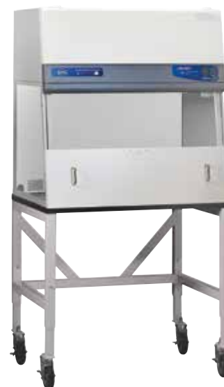
Purifier PCR Enclosures , available in 2', 3', 4' and 6' widths, use ISO 5 air and UV light to minimize contamination.