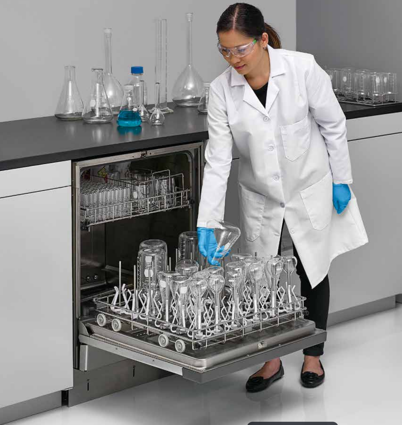
FlaskScrubber and SteamScrubber Laboratory Glassware Washers