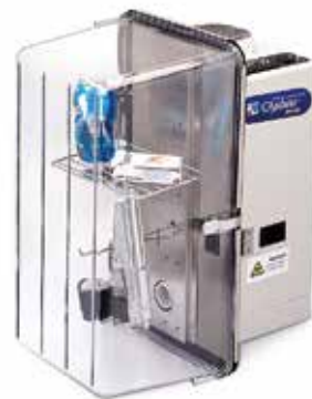
CApture Portable Fuming System combines all needed components into one compact system and requires no ducting.