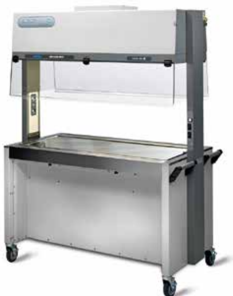
PuriCare Open Access Transfer Station offers easy access on two sides enabling multiple operators to transfer animals from dirty cages to clean ones.