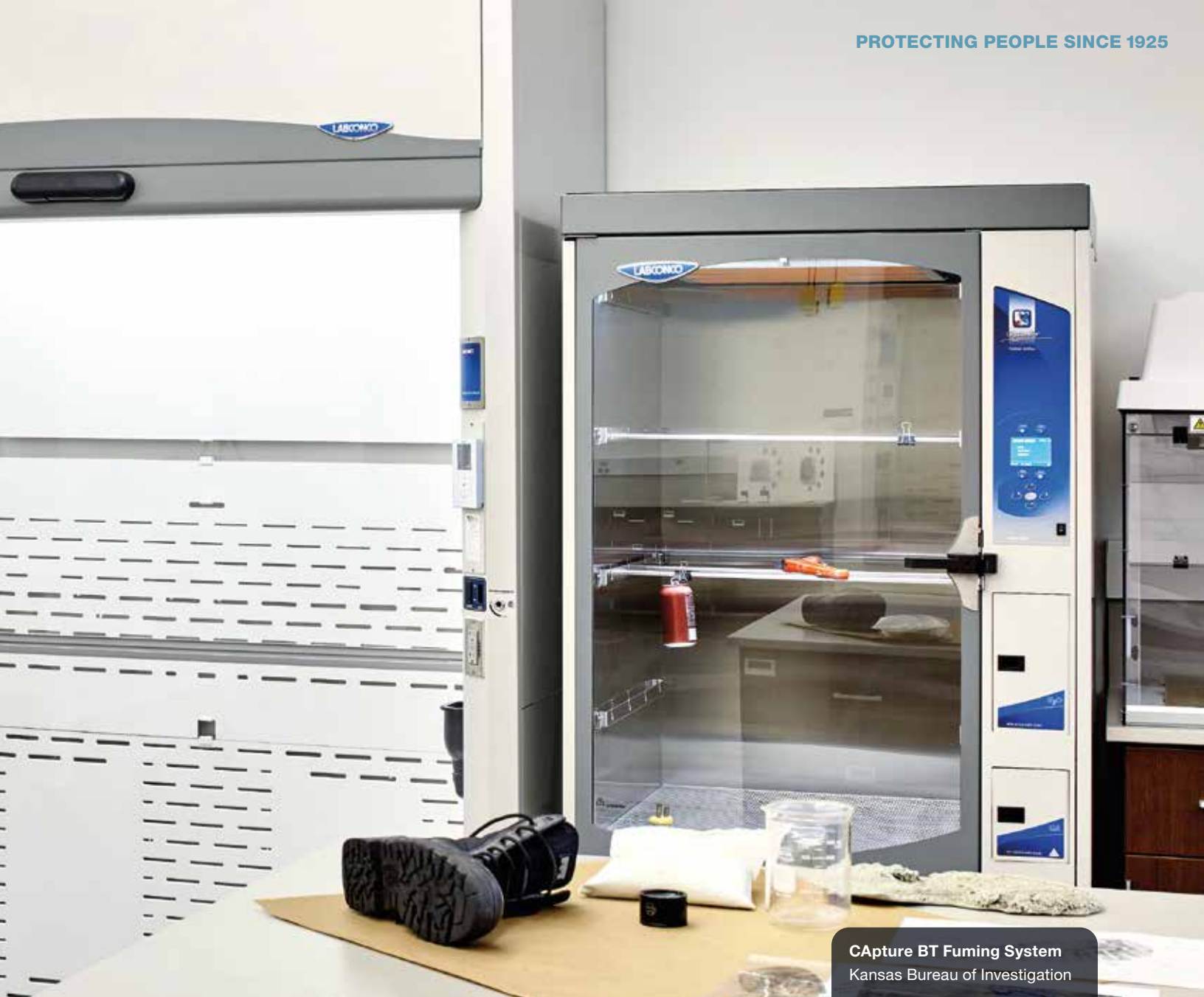
CApture BT Fuming System Kansas Bureau of Investigation