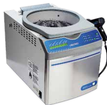
CentriVap Refrigerated Concentrators rapidly concentrate multiple small heat-sensitive samples.

Whatever your sample prep needs—single or multi sample, nitrogen or vacuum—our concentrators and evaporator options make it easy.