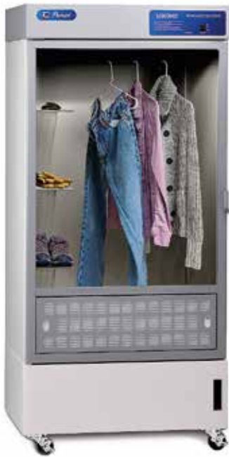
Protector Evidence Drying Cabinet models are available with washdown or UV light.