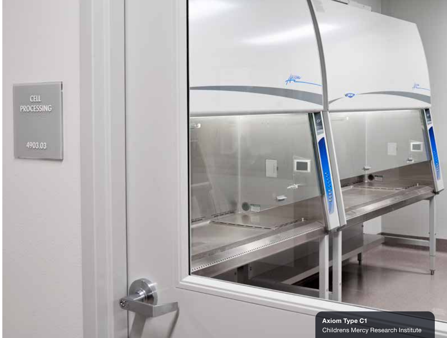
Axiom Type C1 Childrens Mercy Research Institute