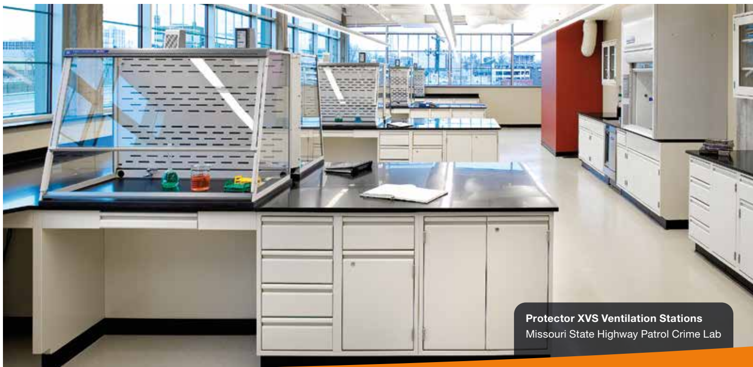
Protector XVS Ventilation Stations Missouri State Highway Patrol Crime Lab

Paramount Ductless Enclosures use carbon filters to adsorb or treat chemical fumes and vapors without the need for outside ducting — offering the environmental benefit of lowering your energy burden.